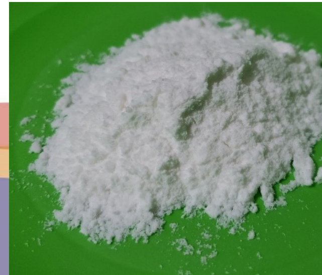
Powered Coconut Water (ACP)