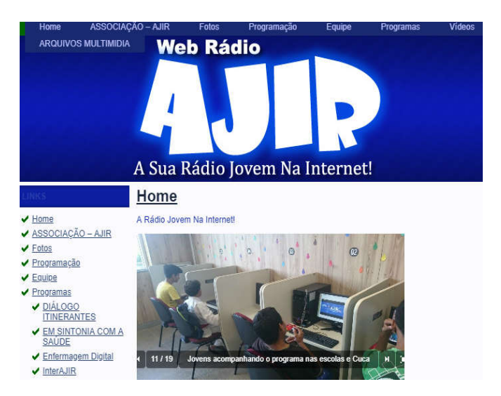
Figure 1. AJIR web radio site. www.uece.ajir.com.br

Radio. The actions are carried out by nursing students from the State University of Ceará (UECE), master and PhD students of the Graduate Program in Clinical Care in Nursing and Health of the UECE. This approach in research is a mode that considers the manner in which the researcher uses the methods and techniques, the form in which she dialogues with the subjects, the paths traced and the apprehension of the discourses (FOUCAULT, 2014; MOREIRA, 2008). The Web Radio is a digital communication channel articulated between the Association of Young People of Irajá - AJIR and the Laboratory of Collective Practices in Health - LECCS/CCS of the UECE, with the support of the Pro-Rectory of Outreach projects - PROEX with registration in the Teaching, Research and Outreach Council (Figure 1).